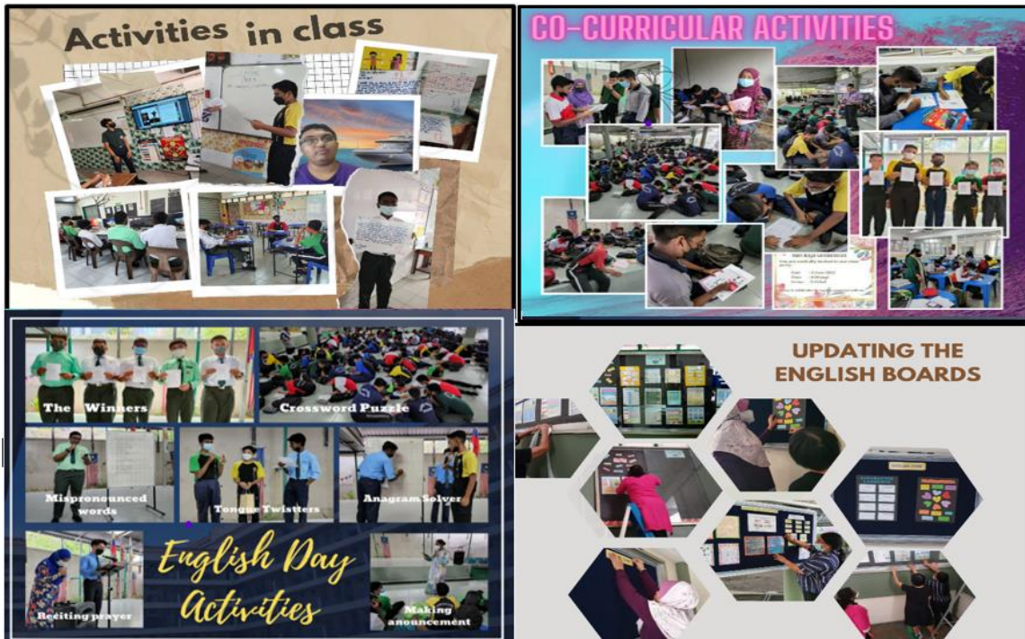
Various activities have been planned to promote the usage of English Language