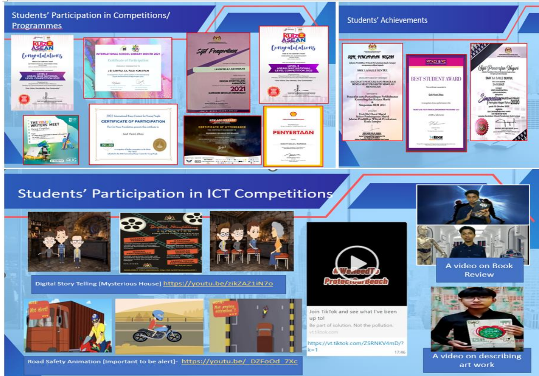
Students Participation and Achievements in Competitions