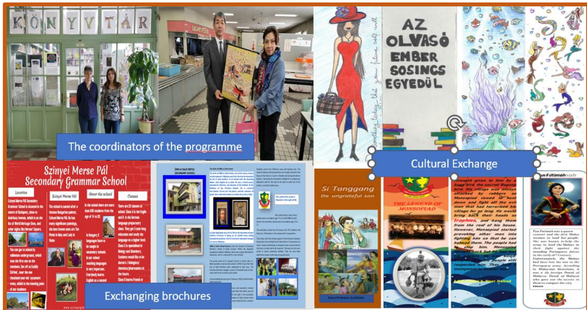
Not just a bookmark exchange but an exchange of culture and thought