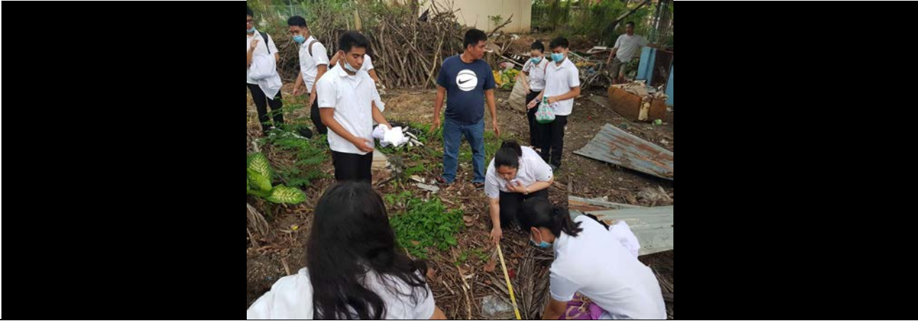
ec2.0 with the CommuniTREE – Young South Hillian Scientists working on ec 2.0 pilot-testing with the barangay captain of Putho-Tuntingin