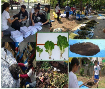
as EC as Juan2Tree - Doing enzymatic composting is as easy as counting from one... to... three...