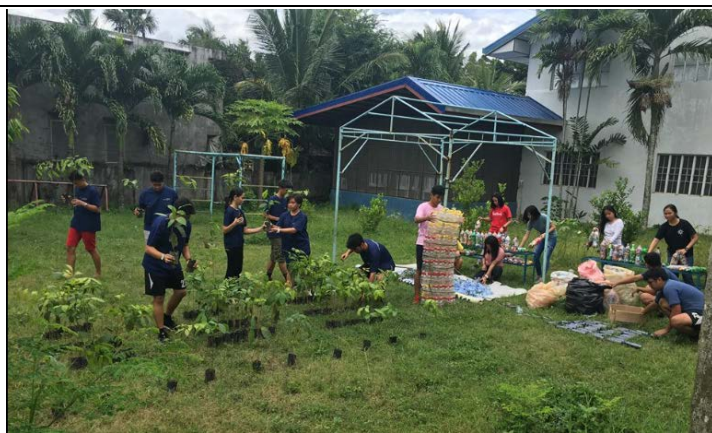
JUAN2Tree meets The Black Rainbow –DEIA South Korea Volunteers build A Tree Nursery for pollution tolerant trees while DEIA-USA Volunteers build a Butterfly garden using plastic bottles