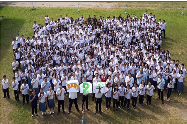
The TREEgged Juans! South Hillians commit to Volun TREE ☺