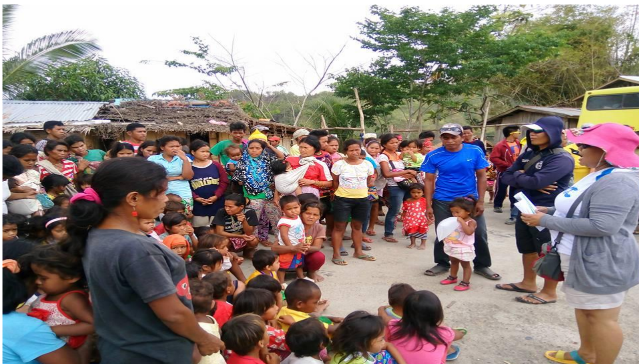
MEETING THE NATIVES. As part of the annual Ecological Tour, the YES Program visited the indigents of Talaingod to share insights on how to preserve the environment.