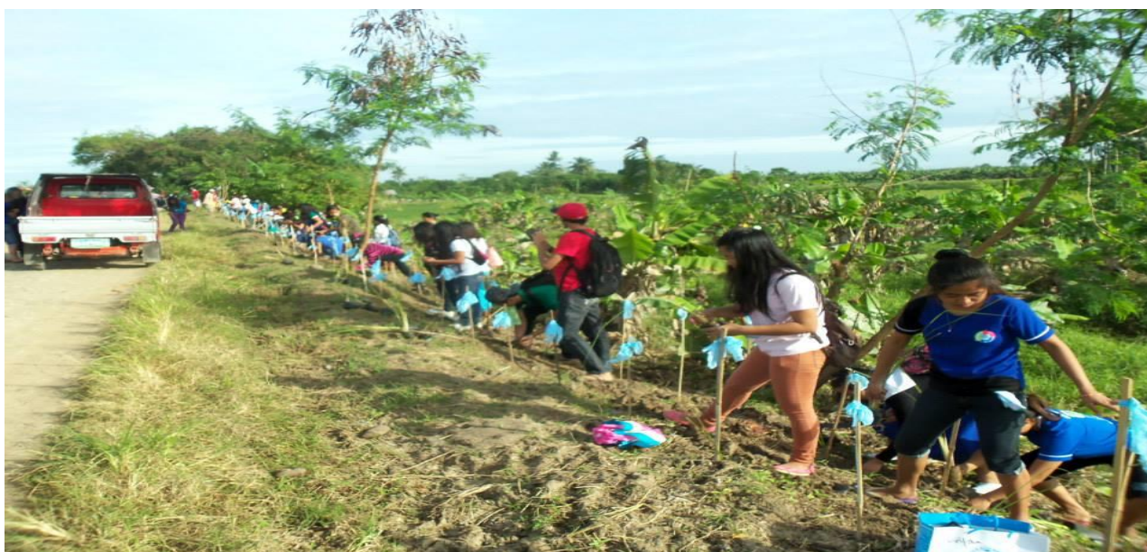
PLANT A TREE, SAVE THE FUTURE. Annually, the members of the Organization plant a tree to mitigate the effects of climate change.