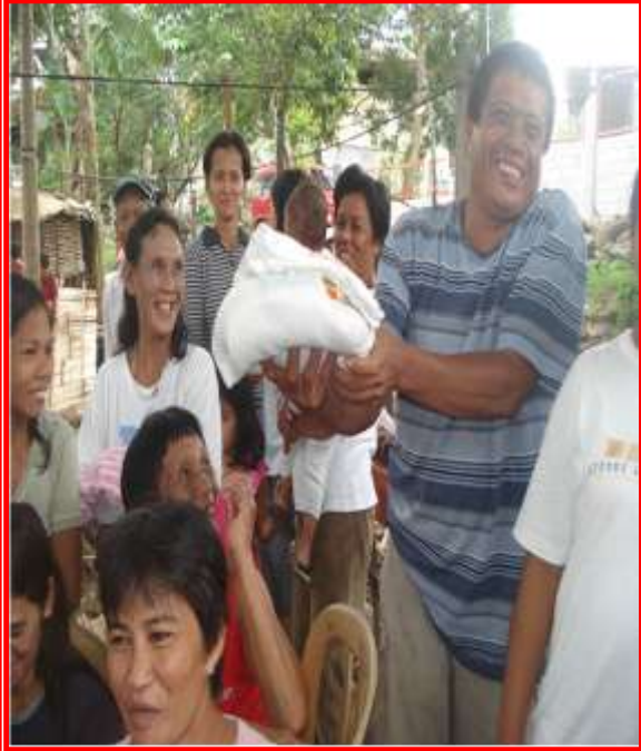
Community outreach program, to different villages nearby school premises.