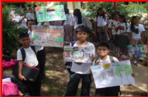
Children showing their certificate of participation in the seminar (left) and their skills in painting (right)