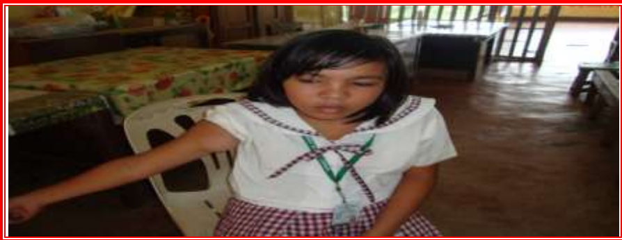
Poor child with cyst on her arm. Recipient of our medical assistance program.