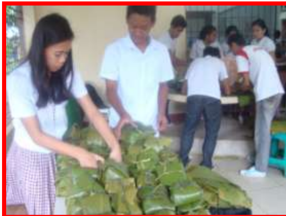
Grocery items (right picture) and bunch of cooked rice (left picture)