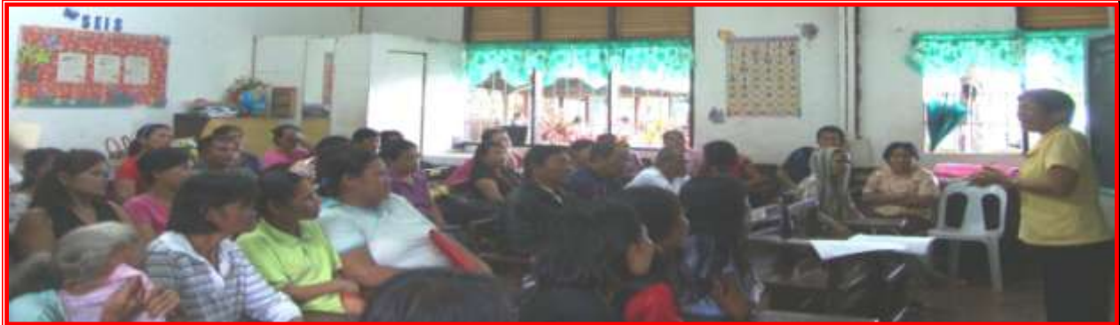
Head Teacher of Values Education giving Family Values Formation to the Parents of the beneficiaries.