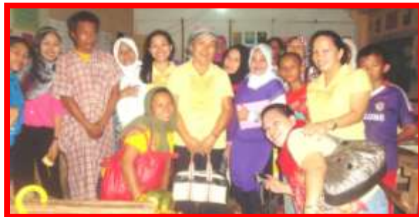
The ZSNHS Conduct Symposium and made actual participation in the said Celebration,