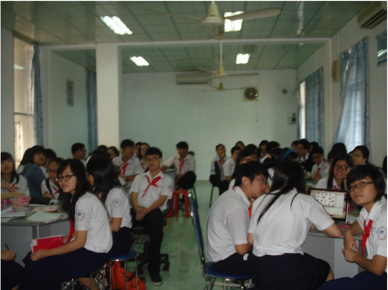
Talks on how to reduce the risk of disasters