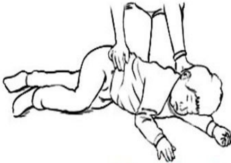
Place the victim lying