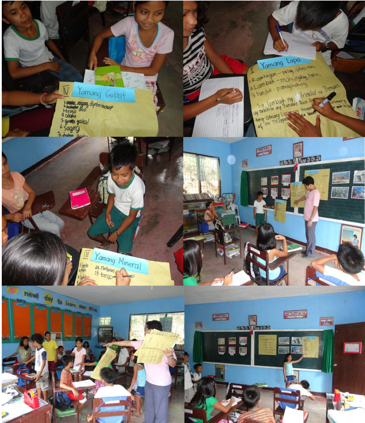
He grouped the pupils and made them to report after their session.