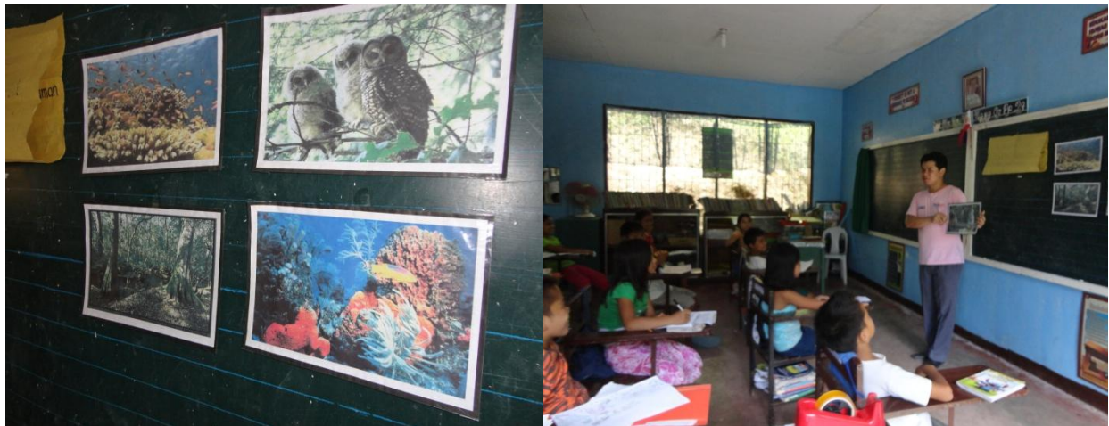
Grade six teacher Mr. Vito Q. Encinares teaches about destruction of natural resources which can cause different calamities