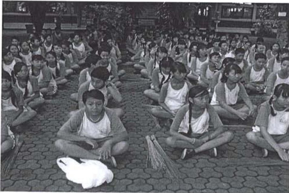
8. The student's creation to maintain cultural of Bali