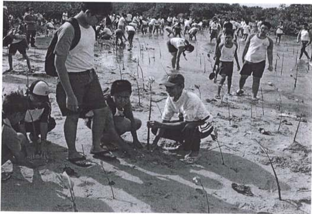
14. Assessment team Adiwiyata Mandiri Center