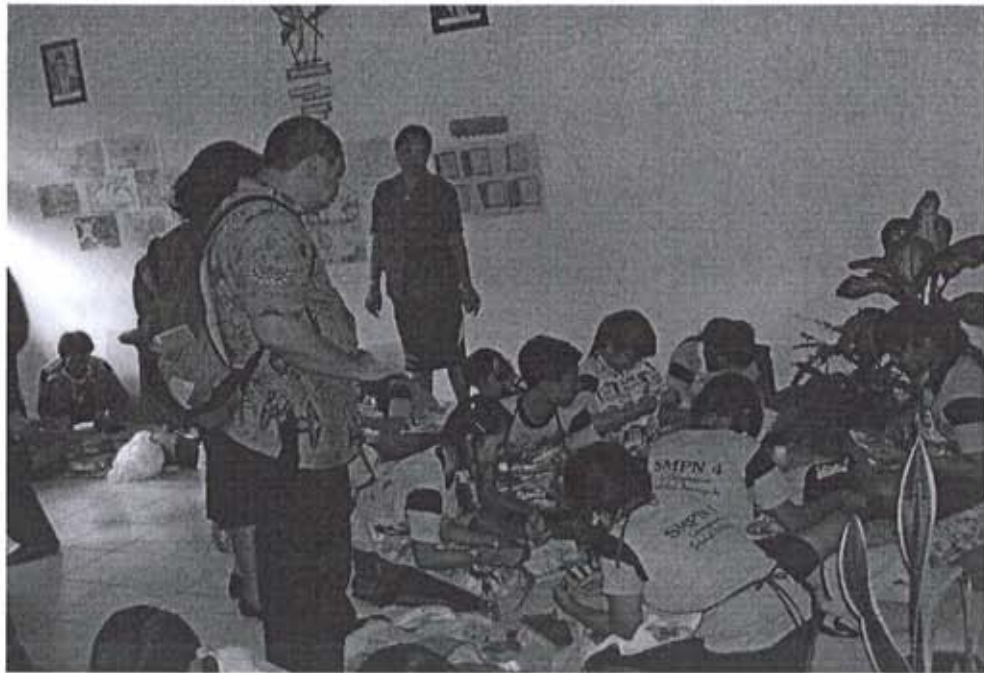
15. Teachers conducting the arrangement of trees