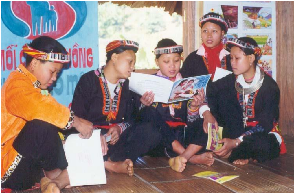
Community Learning Centre in Ha Giang province