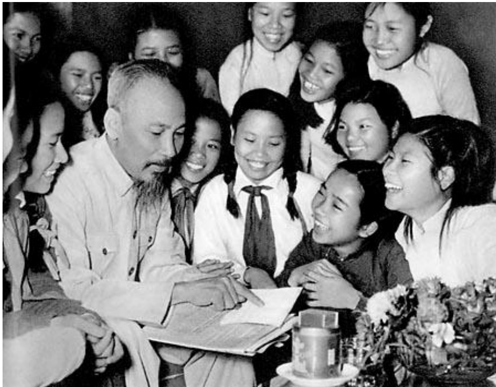
President Ho Chi Minh (1890-1969)