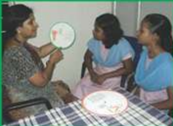
Future seed bearers made aware on hygienic Menstrual cycles by expert