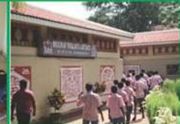
Exposure visit an eye opener for Tribal children