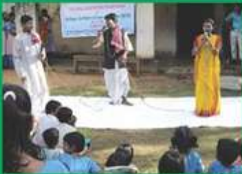
Accelerating the reach of messages through Street play