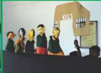
Parlance of Puppets: effective Dissemination