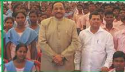
Sri Kantilal Bhuria, Honourable Minister (Tribal Affairs, Government of India)