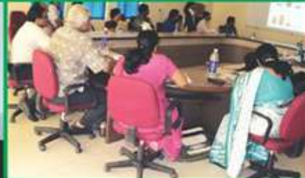
Exploring new facets of LSE, Researcher's contemplation