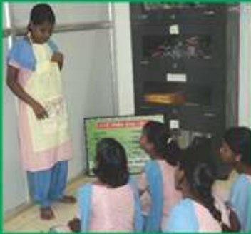
Transcending inhibition; penetration on personal awareness through Peer educator