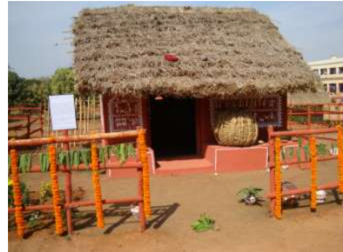
Replica of Home away from home

KISS gives emphasis in preserving the cultural heritage of the tribal students so that they safeguard their time bound rich customs and traditions from the invasion of the materialistic world.