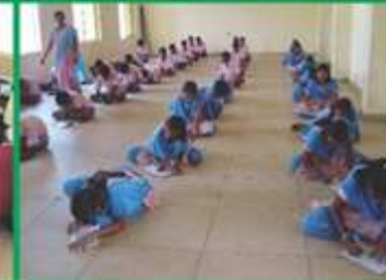
Students participation in Slogan and essay competition on LSE