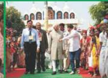
His Excellency Hamid Ansari, the Vice-President of India witnessings tribal promenade