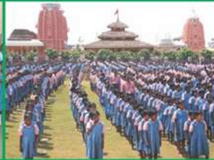
Synergy of students