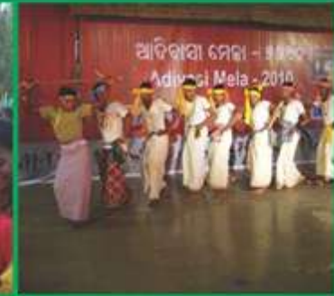
Participation of students in Tribal Fare , roots entrenched with their culture and tradition