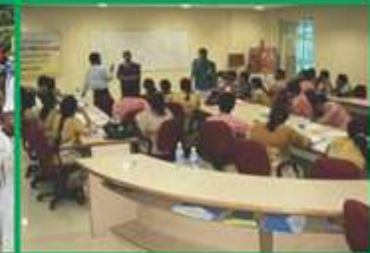
Resource Development through the training of Resource Persons