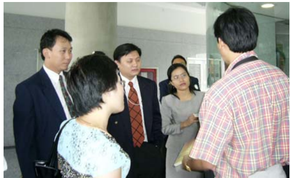
Library tour : facilities and smart card system