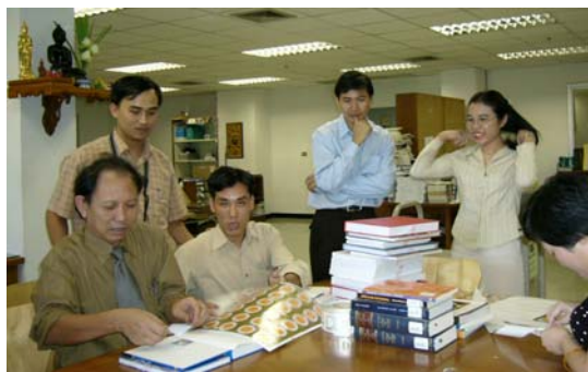
Hands-on sessions for participants