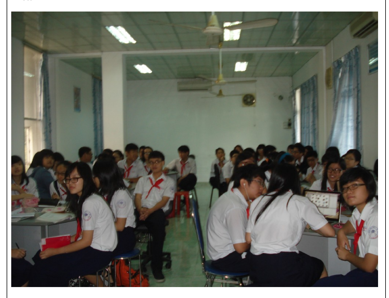
Talks on how to reduce the risk of disasters