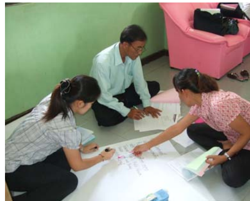
Training on Using CAI to Improve Teaching and Learning Strategies 3-4 October 2008, Ban Pruewai School