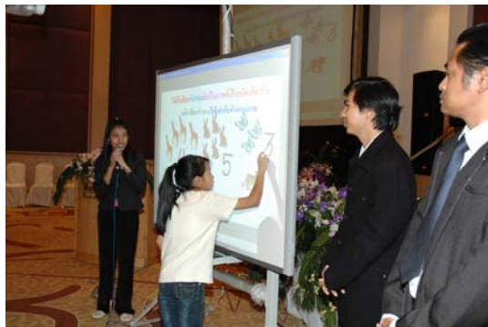
Lesson plan presentation of teachers from Ban Subsanoon School at The ICT Conference of Her Royal Highness Princess Maha Chakri Sirindhorn, 22 November 2008