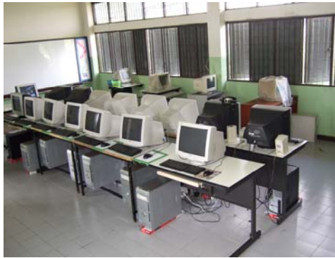
A renovated computer lab of Ban Pruewai School