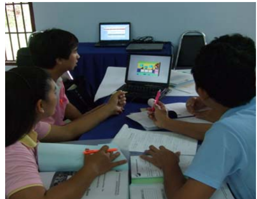
Training on Using CAI to Improve Teaching and Learning Strategies 10-11 October 2008, Ban Subsanoon School